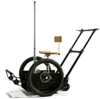
Tube mount For pipe size 6 (1.66 in.) and 8 (1.90 in.)