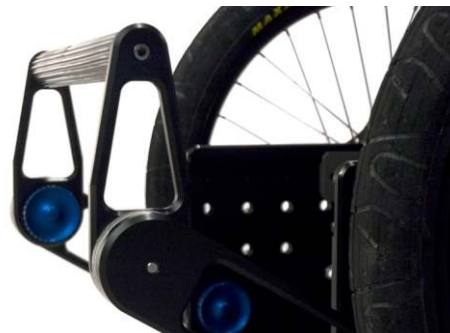
The adjustable foot rest