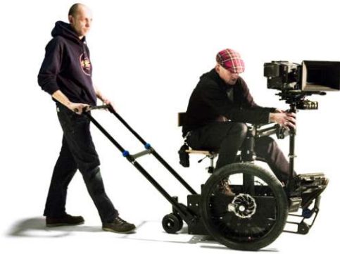
Mid-level camera shot