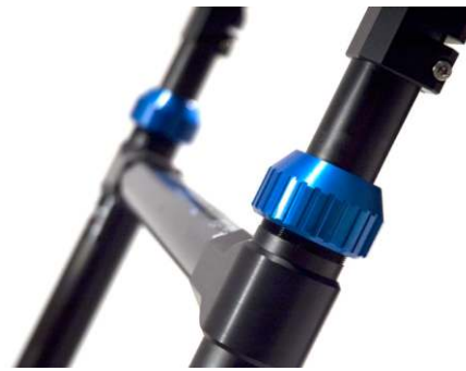
The new push/pull bar with internal hydraulic line