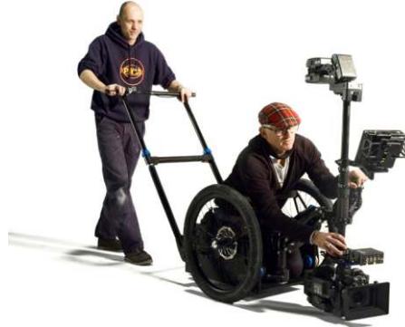
Low-level camera shot