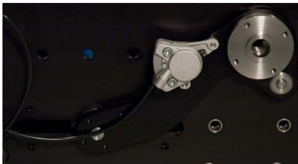
The new wheel suspension lever can be shifted in two directions